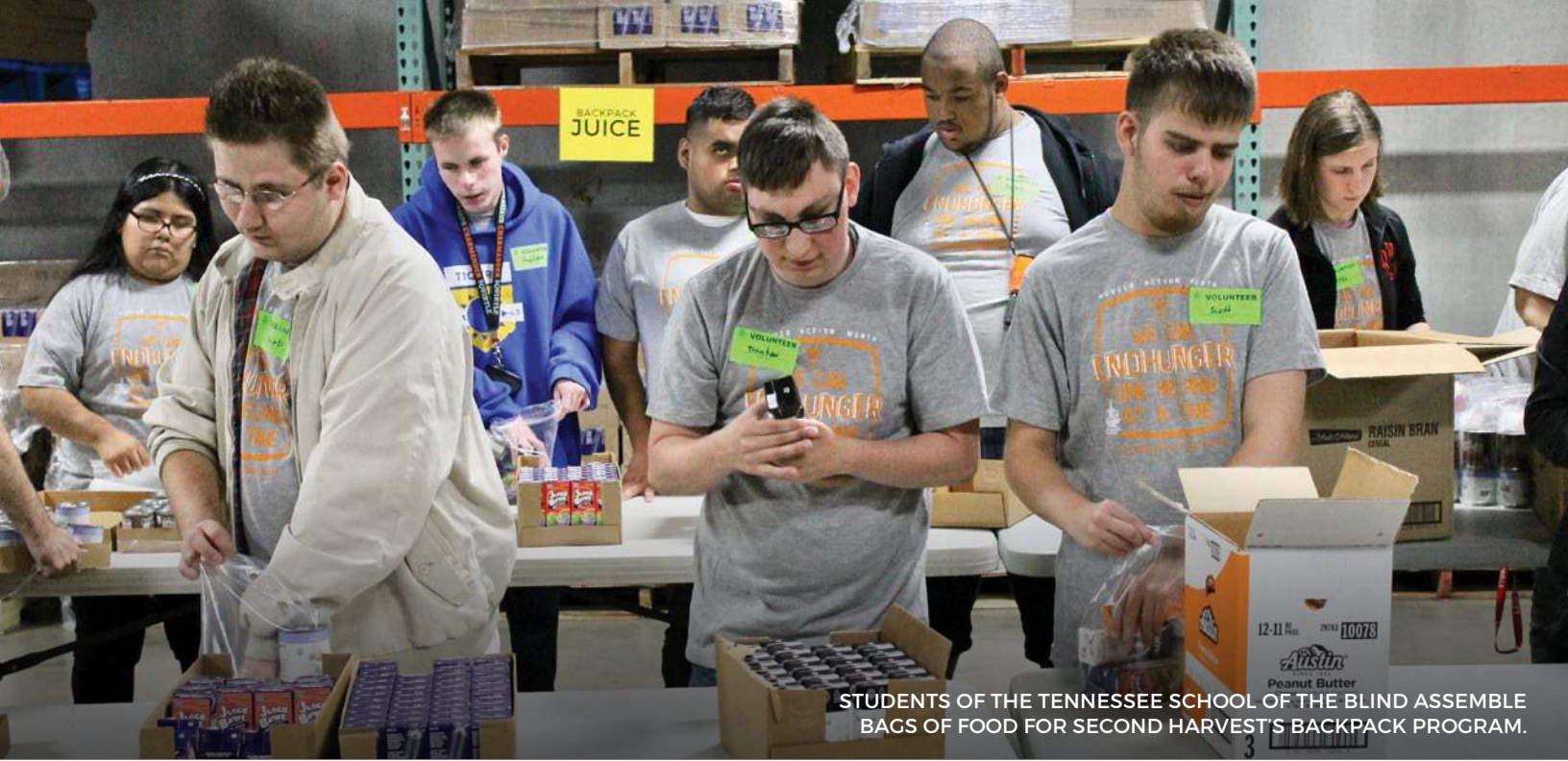
STUDENTS OF THE TENNESSEE SCHOOL OF THE BLIND ASSEMBLE BAGS OF FOOD FOR SECOND HARVEST'S BACKPACK PROGRAM.