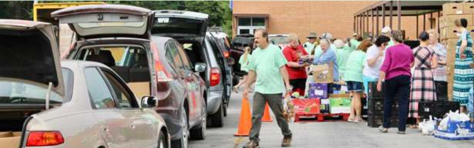
Volunteers deliver fresh produce during a no-contact, drive-thru distribution in Crawford, Overton County. Hosted by 5 Loaves Food Pantry, this event usually serves 180 families. With recent COVID-19 closures and job losses, however, this Second Harvest Partner Agency now serves up to 350 families per distribution.

Here are just a few ways your generosity is enabling Tennesseans to access the nutritious foods they need to stay active during this difficult time. We could not do it without you.