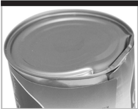
Severe dent in seam