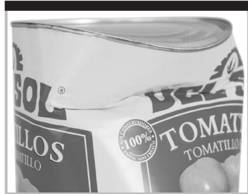
Deep dents in can body