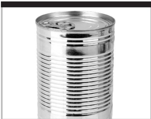
Missing or unreadable labels