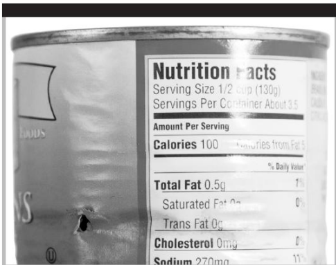
Holes or signs of leaking