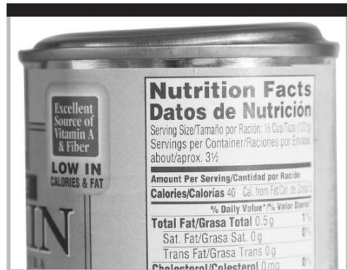
Swollen or bulging ends